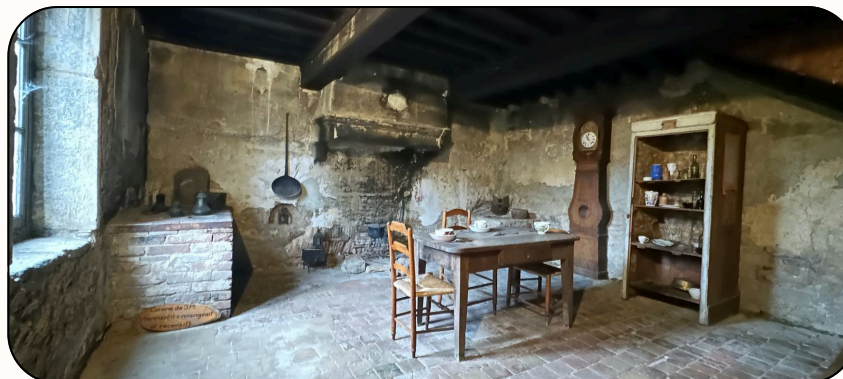
Ars: Visit the humble home of Saint John Vianney, go to confession, and pray with the incorrupt body of the Curé of Ars who helped thousands to come back to Christ.