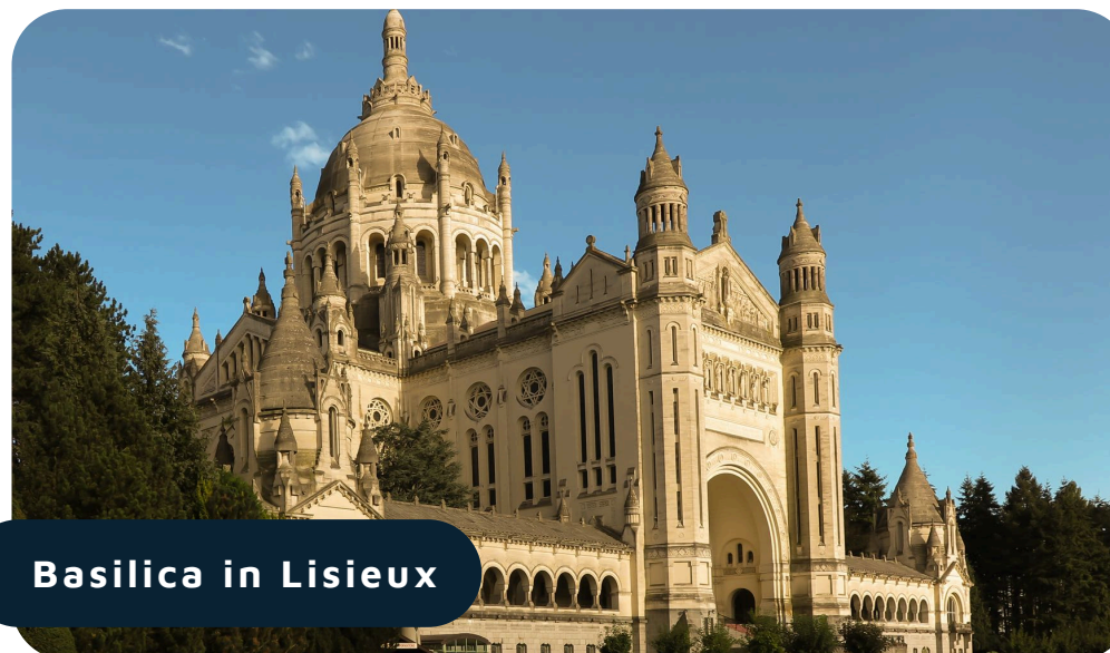
Basilica in Lisieux