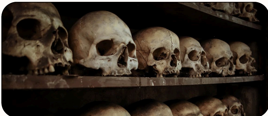
Martyrs of the French Revolution: Ask these martyred priests what it means to give everything for your vocation.