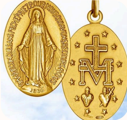
Chapel of the Miraculous Medal: A Marian Apparition site that also has the relics of Saint Vincent de Paul.