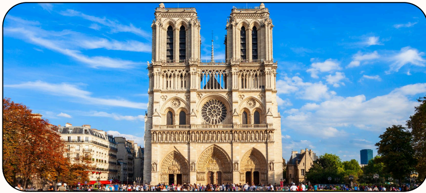
Notre Dame: Explore the newly restored Cathedral of Paris. Learn of Saint Joan of Arc's history here.