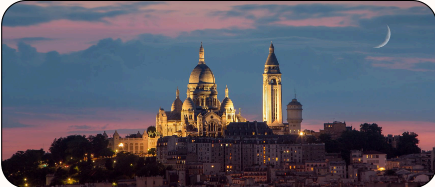
Sacré Coeur: Stay the night at this basilica, and participate in adoration with the sisters.