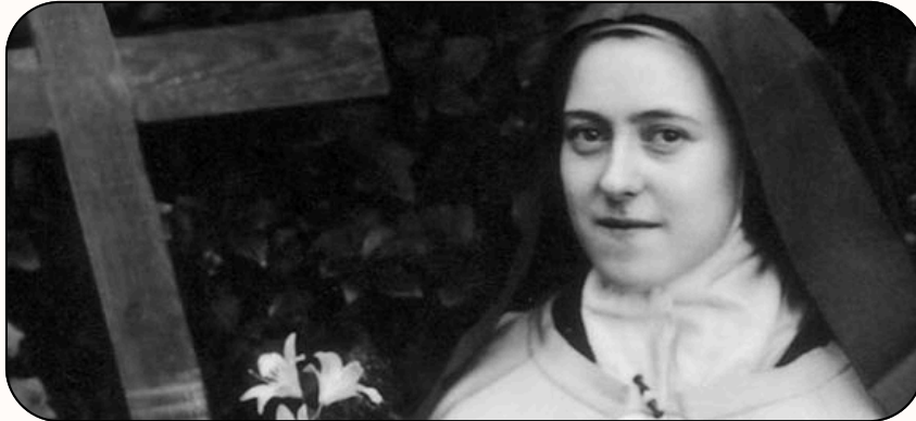
Lisieux: Venerate Saint Thérèse of Lisieux's relics in the Carmel that she fought to enter to fulfil her vocation.