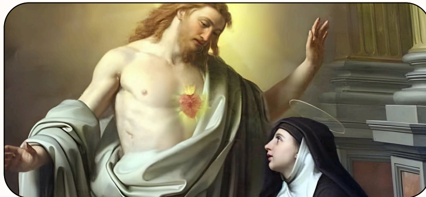
Paray-le-Monial: Return love for love, in the apparition site where Jesus revealed His Sacred Heart to the world.